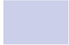
Imaging Area of CCD

The Alta U9 uses a large format 6-megapixel Kodak Blue Plus sensor, ideal for applications requiring a large field of view with a smaller pixel.